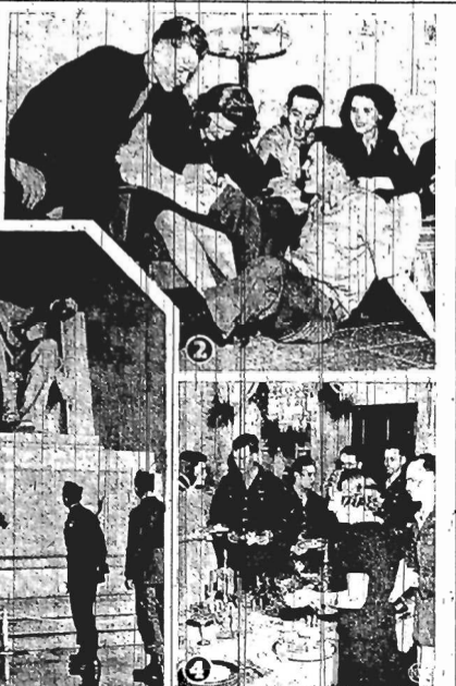
FT. BRAGG PARATROOPERS LAND, HAVE CAPITAL WELL IN HAND.

From Capitol Hill to the social heights of Georgetown, a whirlwind group of 45 paratroopers took Washington by storm for a short hour of leave. The boys from Ft. Bragg talked a Fayetteville banker into lending them $1,000 for the trip—but they had a million dollars' worth of fun and entertainment when they returned. Starting out, these members of the 504th airborne infantry